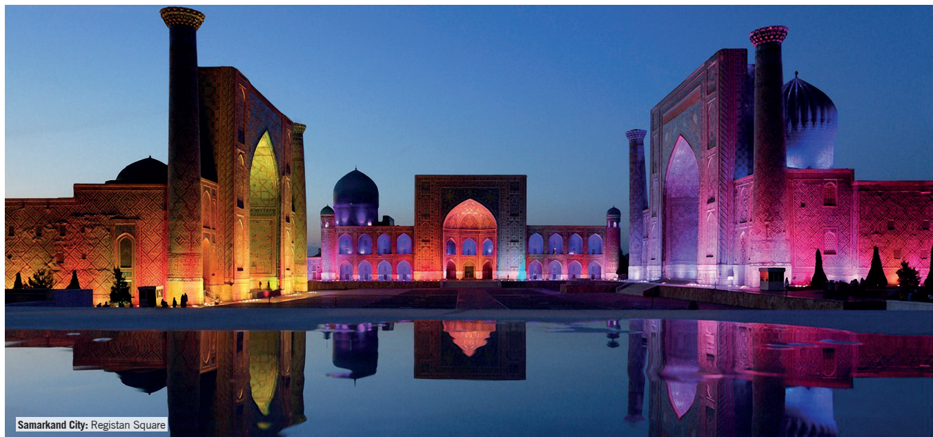
Samarkand City: Registan Square

To consolidate these important values, a major constitutional reform was initiated. Citizens have taken an active role in shaping the new constitution in a nationwide discussion. Tens of thousands of proposals from citizens were considered by a Constitutional Commission, consisting of MPs, senators, and representatives of civil society. The president has proposed initiatives for future inclusion, including the