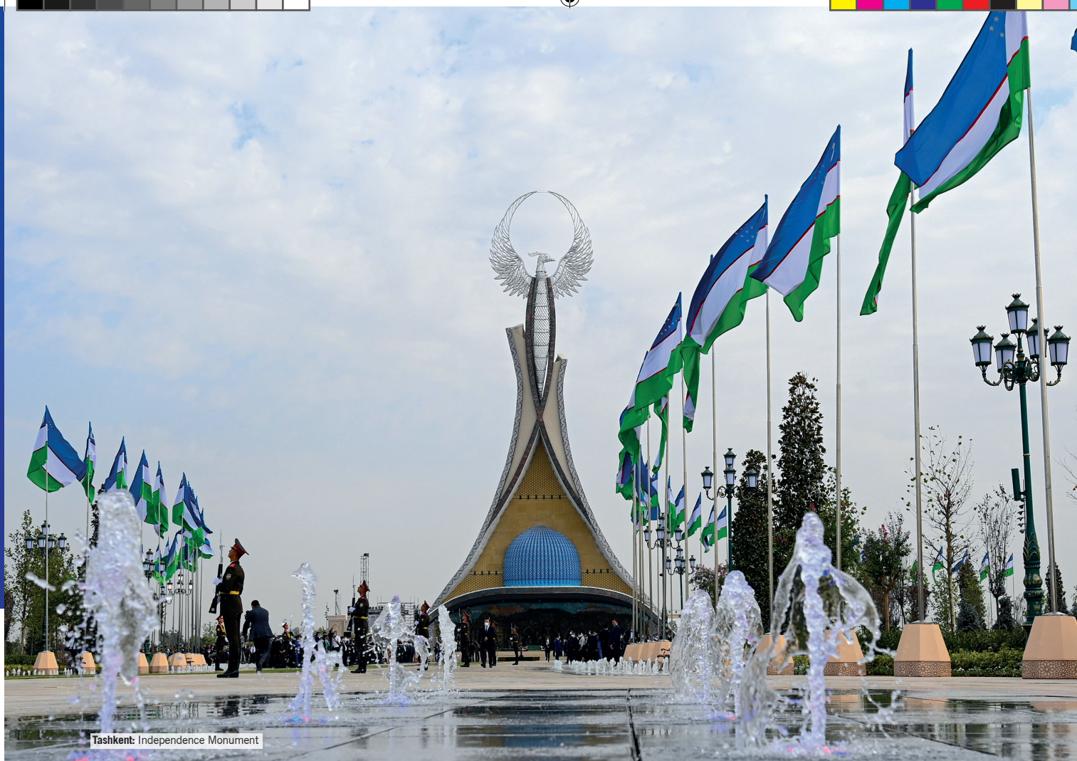
Tashkent: Independence Monument

abolition of the death penalty, the establishment of Miranda Rights, and Habeas Corpus principles.