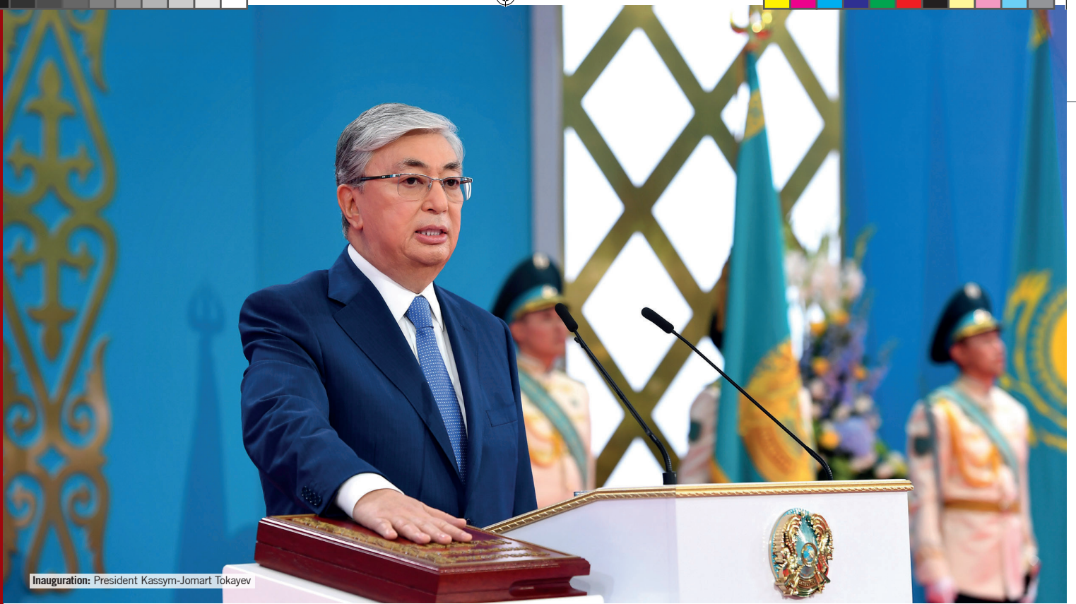
Inauguration: President Kassym-Jomart Tokayev