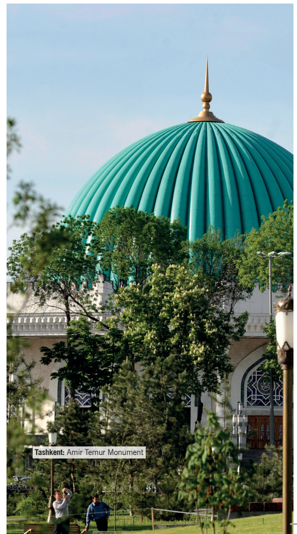
Tashkent: Amir Temur Monument