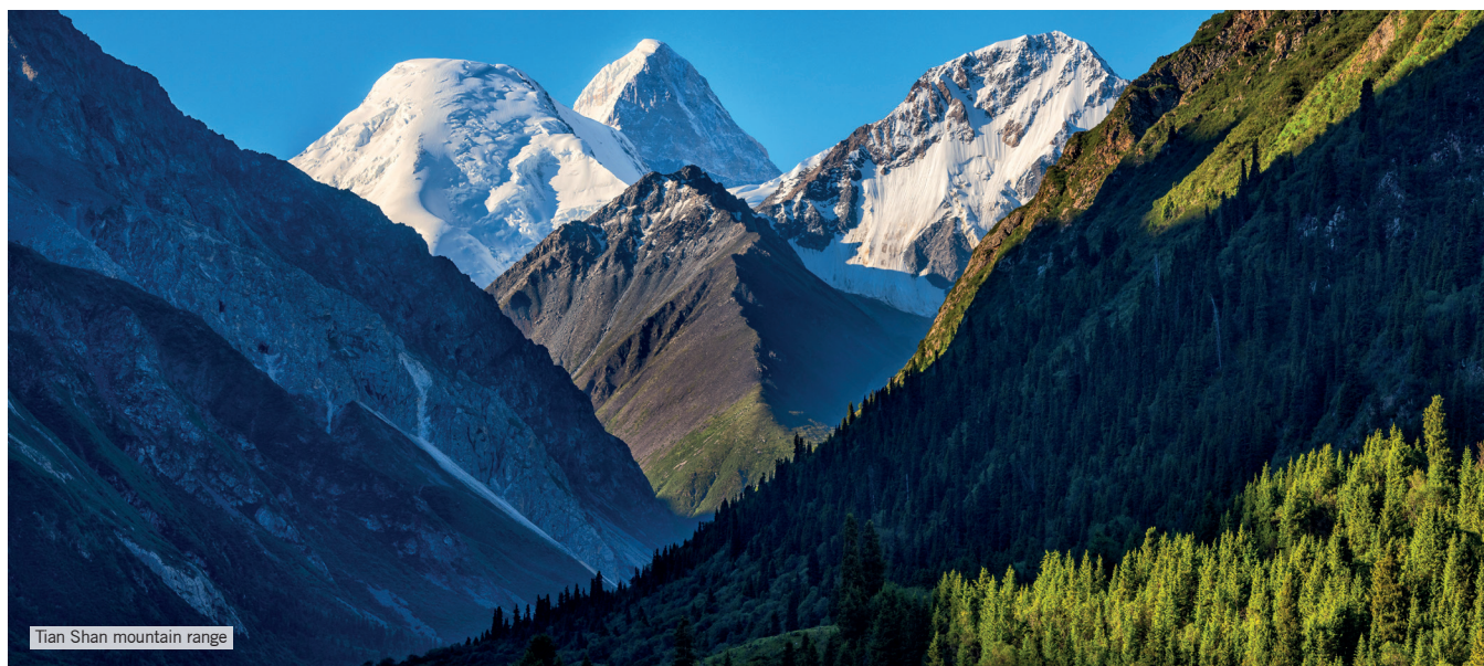
Tian Shan mountain range