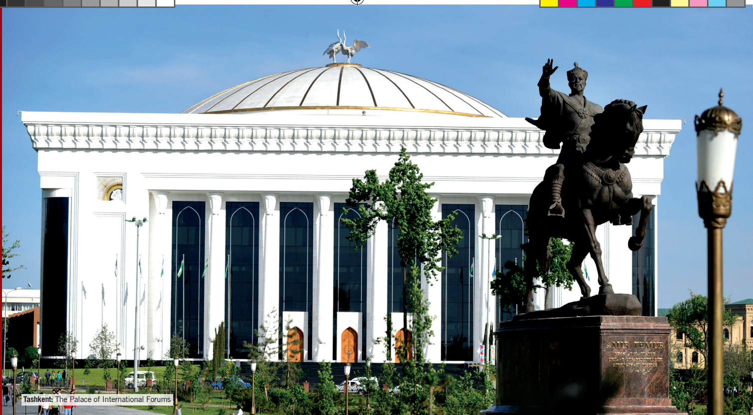
Tashkent: The Palace of International Forums

Uzbekistan promotes regional security and stability and is a leading supporter of processes aimed at peaceful settlement in Afghanistan. It is actively participating in the reconstruction of the country. Due to challenges of the Aral Sea disaster, water shortages and food security, Uzbekistan is embracing efforts to control climate-change.