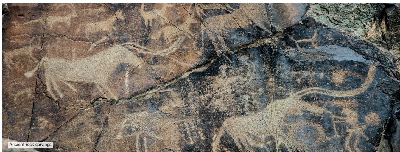
Ancient rock carvings

Kazakhstan has worked hard to create such a climate, not only for its own business sector, but also for the increasing number of foreign investors. Social stability is key, as is the evolution of legal frameworks to bolster investor confidence.